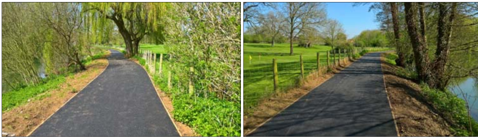
Cycle improvements undertaken at Monkton Park, Chippenham

Recent larger schemes include cycle improvements at Wingfield Road Trowbridge, Perham Down to Tidworth, Monkton Park Chippenham and the completion of works at the Amesbury to Bulford scheme. Other schemes include substantial traffic management works at Zeals, Dilton Marsh, Baydon and West Ashton, a signal controlled crossing on Frome Road, Bradford on Avon, and major safety improvements at the B4040/B4696 Leigh Crossroads.