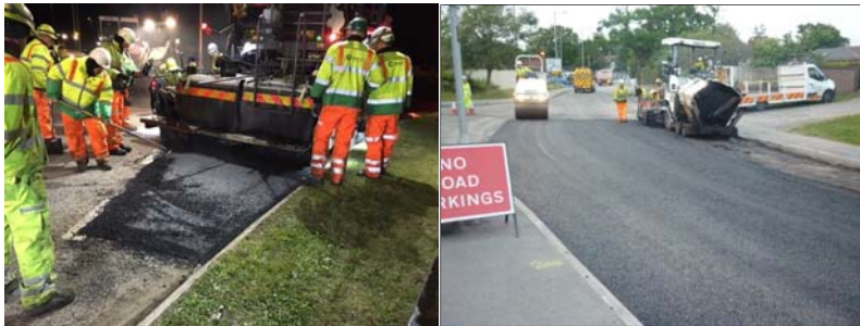
Wiltshire Council is making a major investment in improving the condition of the county's roads.

The Council's 'Local Highways Investment Fund 2014 – 2020' has been making a massive investment to improve the condition of the roads in Wiltshire, and has already reduced the backlog by 30%. The programme of work started in April 2014, and is designed and supervised by Atkins, with most of the surfacing work carried out by Tarmac and Eurovia, with support from Ringway.