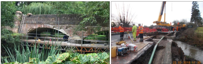
A programme of bridge strengthening and renewal is being undertaken by the Council's contractors

Ringway operate three full time bridge construction/maintenance gangs to carry out works from minor maintenance up to full bridge reconstruction. Additional resources and sub-contractors are on occasions called upon to cater for extra large schemes or more specialist schemes.