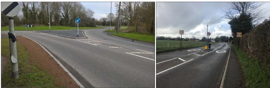
A number of pedestrian improvements and traffic management schemes have been constructed

In addition the team has delivered a significant number of smaller scale projects, such as pedestrian crossings, area wide 20mph speed limits, advisory 20mph speed limits outside schools, footway improvements and gateway schemes.