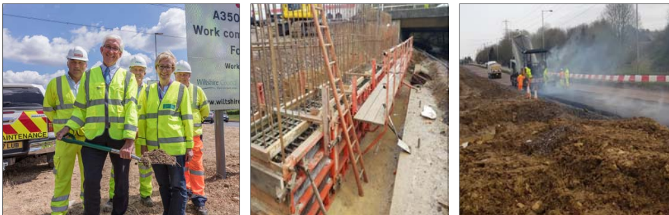
Work started on Phase 3 of the improvement works on A350 Chippenham Bypass.

The Council started two major highway improvement schemes during 2017/18. At Chippenham the third phase of the A350 Chippenham bypass improvements includes alterations to Chequers Roundabout on the A4, and the dualling of the remainder of the section of the A350 between the A420 and the A350 north of Chippenham. The scheme is programmed for completion in the summer of 2018.