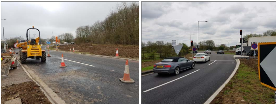
Improvements at the M4 junction 17 improved safety and reduced delays.

The M4 Junction 17 works involved the signalisation of the roundabout and resurfacing works. The opportunity was taken to carry out additional surfacing on the slip roads for Highways England to avoid future disruption. The junction improvement scheme was funded by Highways England and SWLEP, and implemented by the Council. The scheme has improved safety and capacity at the junction, and reduced journey times on this important route. The signal control has reduced the risk of traffic queuing back onto the motorway and causing a hazard to other traffic.