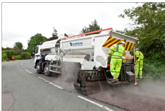
An extensive programme of surface dressing helps seal and protects the county's rural roads, and improves skid resistance.

Despite many of the sites being difficult because of the proximity of properties and the potential disturbance and disruption for businesses and residents, much of the recent surfacing work has attracted very positive comments from the public and local residents.