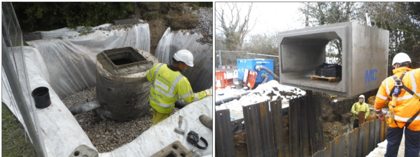
The Council has carried out drainage improvement and flood alleviation schemes across the county.

A specialist Drainage Investigation and CCTV Survey team working for Ringway locate, clean, survey and map the underground drainage network. Survey and asset condition data collected from the drainage investigations and surveys is recorded for future reference.