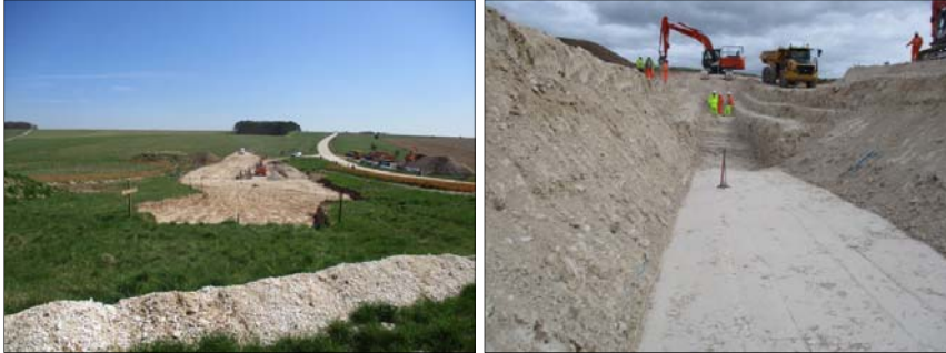
A substantial flood alleviation scheme is being constructed at Tilshead

A programme of drainage investigations, repairs and flood alleviation schemes was undertaken in 2017/18. The work is co-ordinated through the three Operational Flood Working Groups that include the Environment Agency, Wessex Water, other organisations and stakeholders, including the town and parish councils.